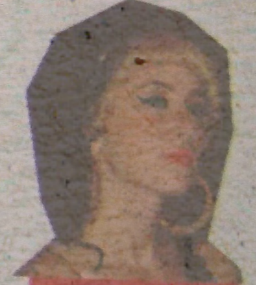
Kraayshawn Nude Pics Leaked